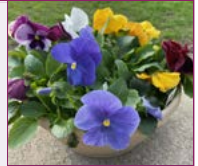
One of our beautiful pansy bowls on sale now!

Come choose a lovely multi-colored pansy bowl for your patio or for someone special. Mother's Day is this Sunday the 9th! They are hardy and will hold up well in the cool days/nights of May in Wisconsin!