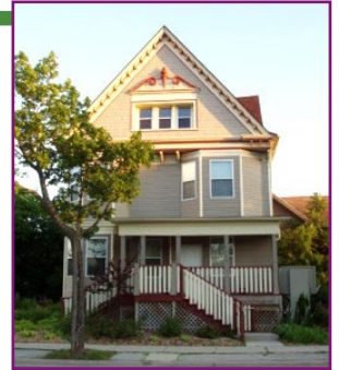
Serenity Inn: 2825 W. Brown St.