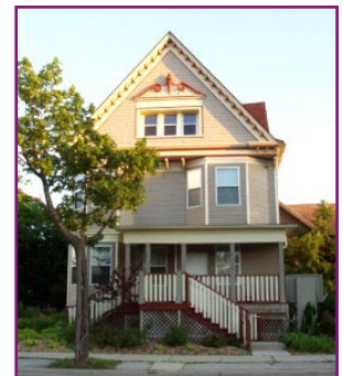
Serenity Inn: 2825 W. Brown St.

Qdoba Piggly Wiggly Jimmy John's Jersey Mike's