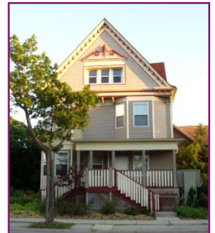
Serenity Inn: 2825 W. Brown St.

Qdoba Piggly Wiggly Jimmy John's Jersey Mike's